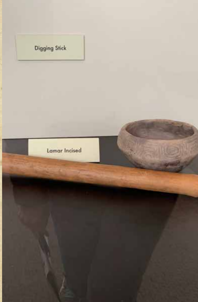
The record of the election, obtained by T.R.R. Cobb House