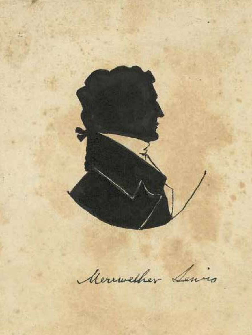
Silhouette of Meriwether Lewis