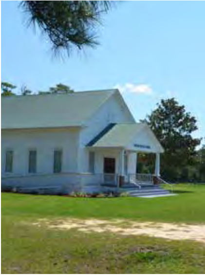
Goloid Baptist Church as it appears today.