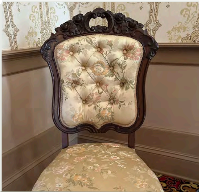
Lamar family lady's parlor chair