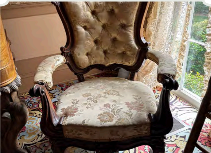
Lamar family gentleman's parlor chair

wanted them to understand the difference between a couch, a sofa, and a settee. Figuring I'd receive guesses of couch or sofa from the students, several hands immediately shot up in the air. Finally, I selected one determined young lady and again asked her what we would call this particular piece of furniture. "Rococo Revival" she answered without hesitation. As I stood there staring at her, my attention then drifted up to the couple of teachers and a few parents standing at the back of the room, all of us with our mouths wide open and eyes about to pop out of their sockets. I finally got enough composure back and answered, "That's right!" Then I asked her, "Where did you