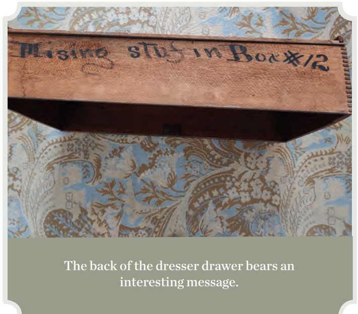
The back of the dresser drawer bears an interesting message.

It's clear from the back of the drawer that something was missing from a box, mostly letters from words. To be fair, Noah Webster did not print the first American speller until 1783 and didn't