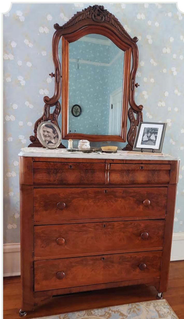
American Empire furniture often incorporated acanthus leaf carving and mahogany veneers.