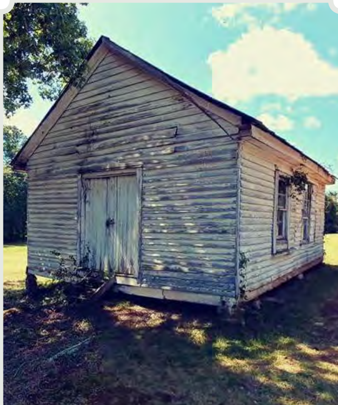
Cherry Grove just prior to rehabilitation.