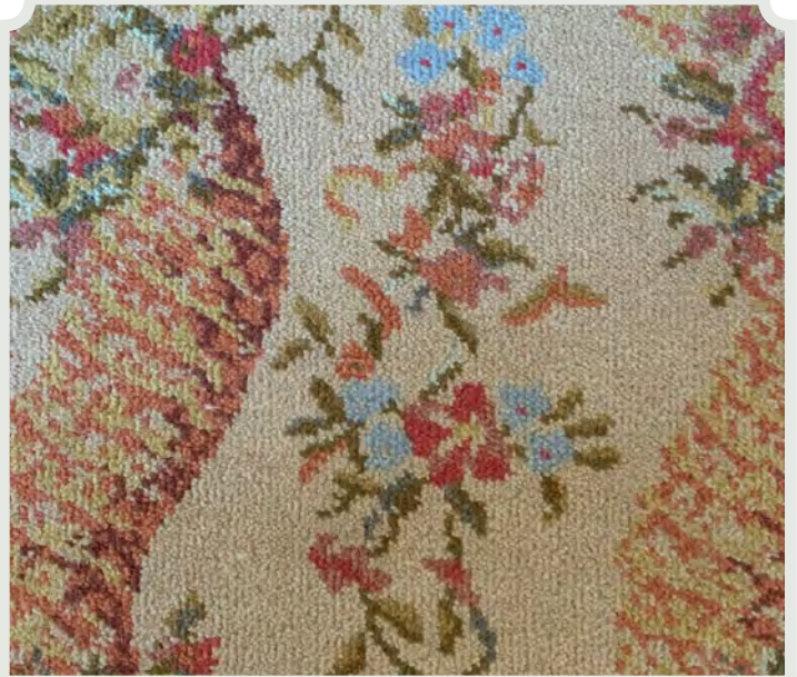
Kiby strike off from Stark Carpet.