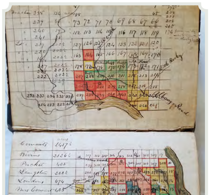
Notes provide historical and even ancestral insight.