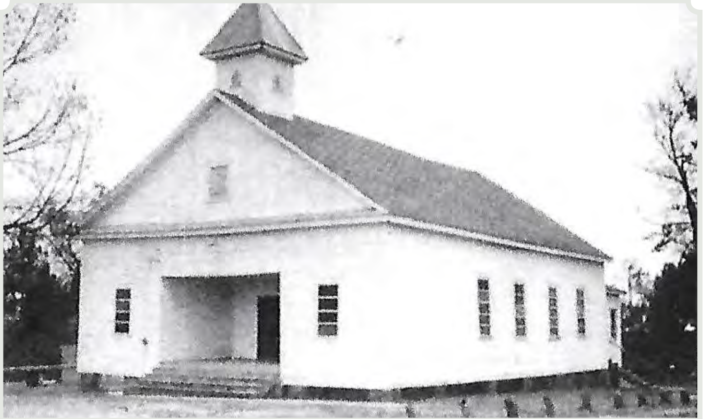
Grove Church about 1910.