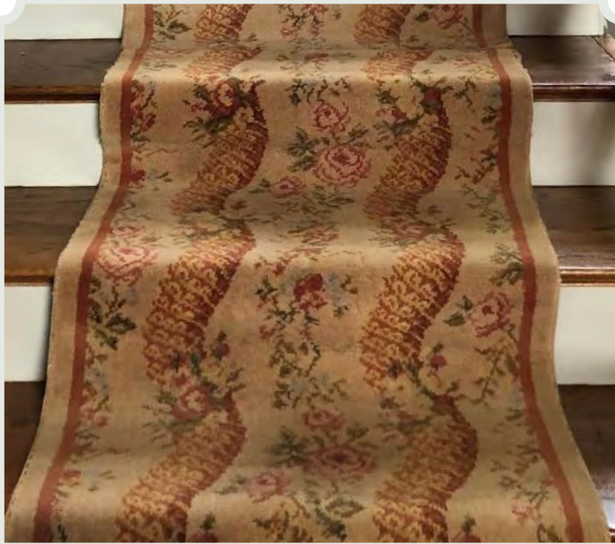
Original 1940s stair runner carpet.