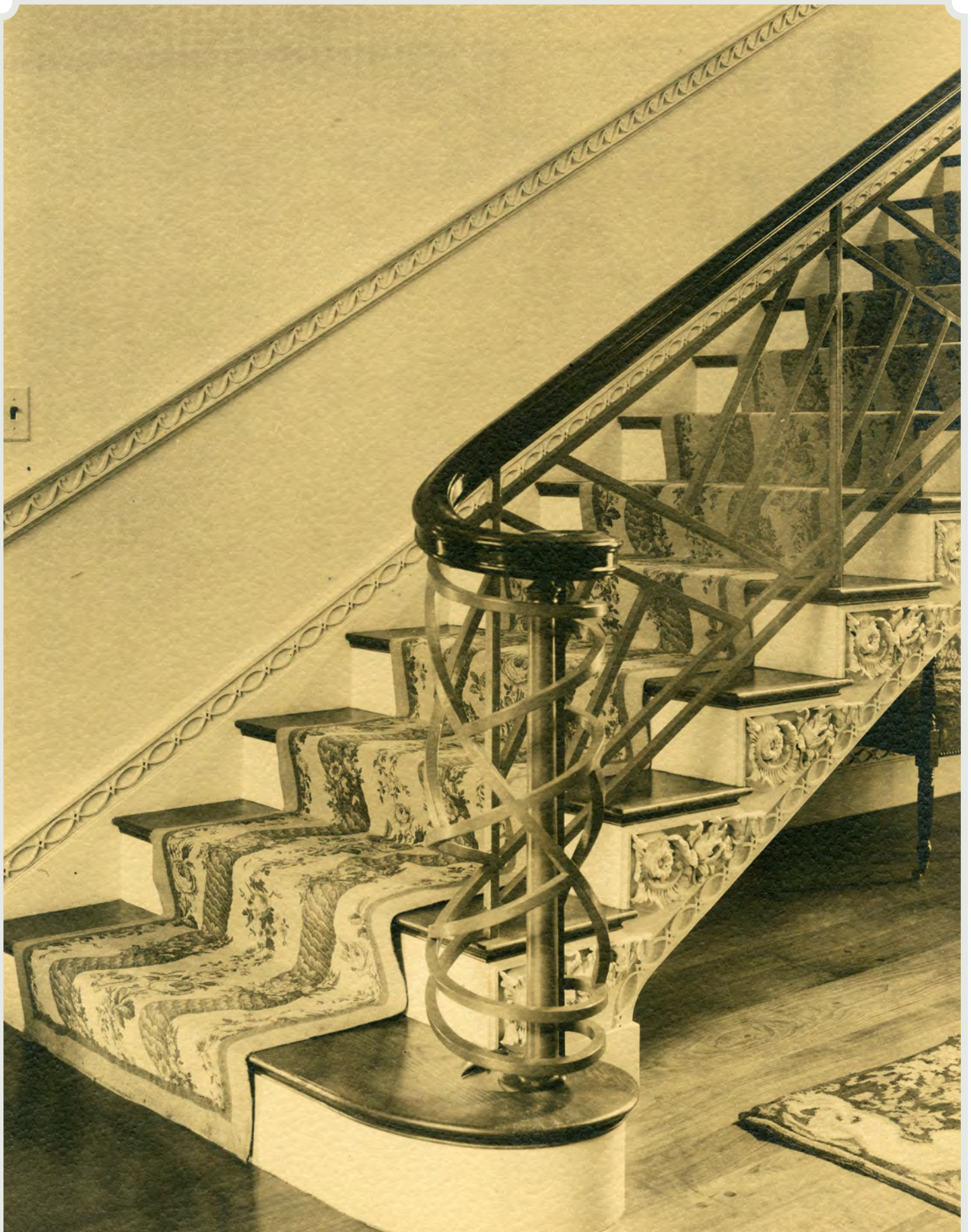
1931 photo by Tebbs & Knell of the original needlepoint runner.