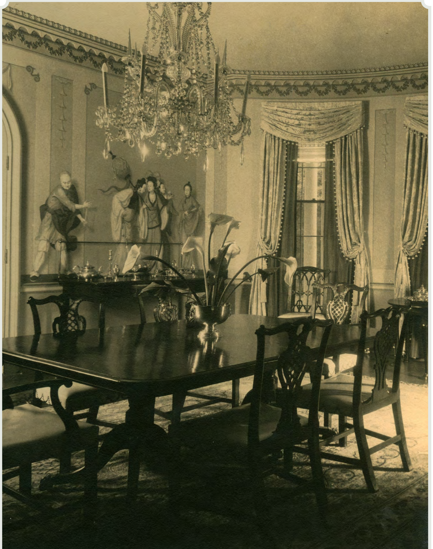
1931 Tebbs & Knell photograph of dining room chairs.