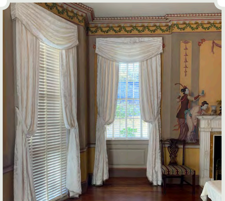
White damask by Gainsborough Silk Weaving Co., Sudbury, UK.