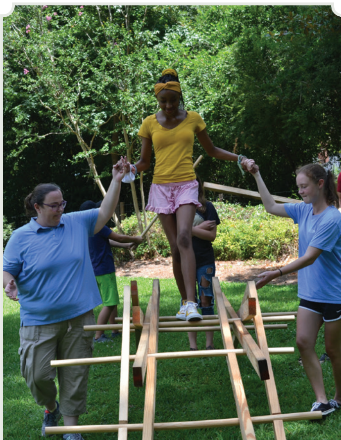
"Inventions Camp" - Campers wanted to test out the DaVinci Bridge they constructed in the Incredible Inventions Camp