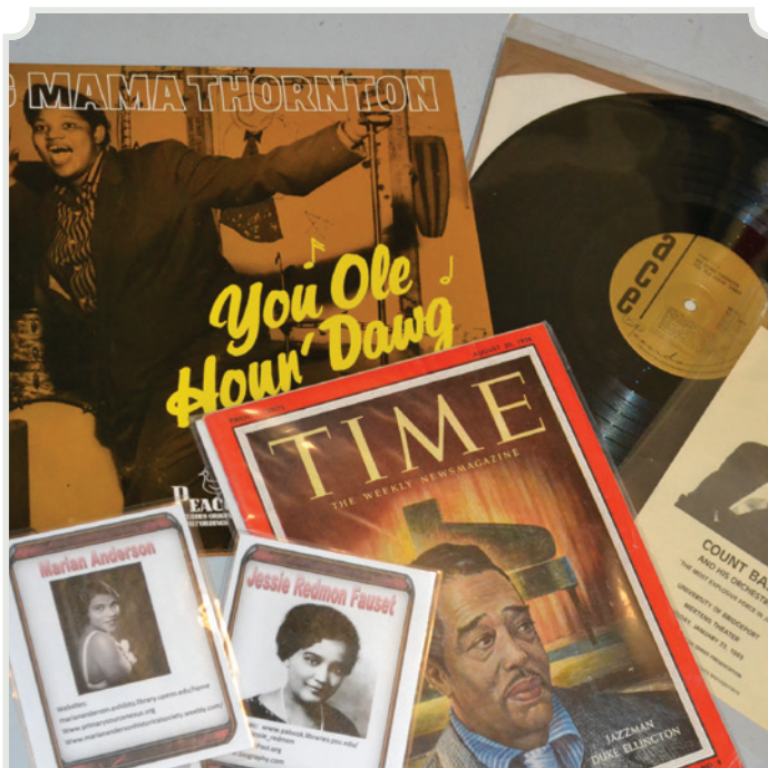
"Harlem Renaissance" - Our new traveling trunk celebrates the people associated with the time period and their important contributions to art, music, literature, and film