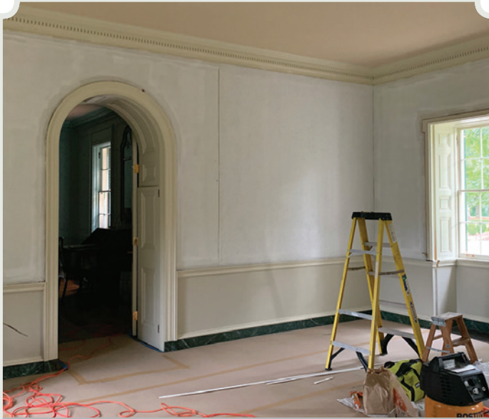
Batting installed on library walls