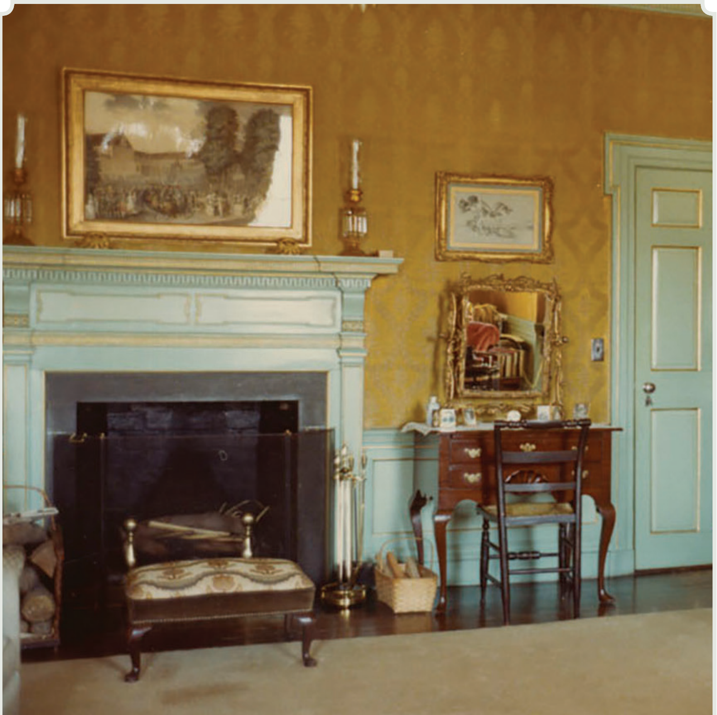
Nightingale-Brown House, Providence, Rhode Island

to cry!” By October 2018, the screen arrived at Goodrum House.