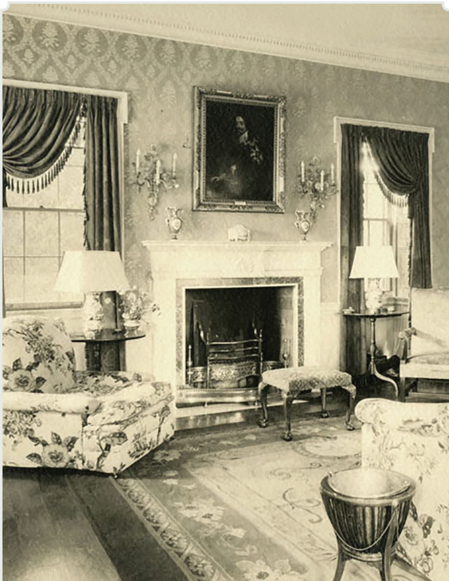
Library, May Patterson Goodrum House, c. 1932