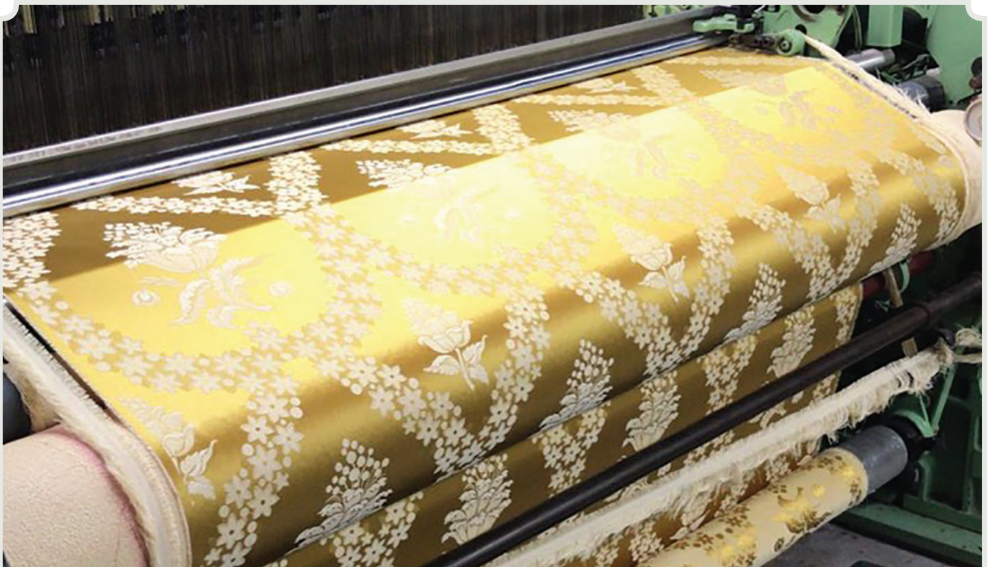
Fabric on loom, Prelle et Cie, Lyon, France