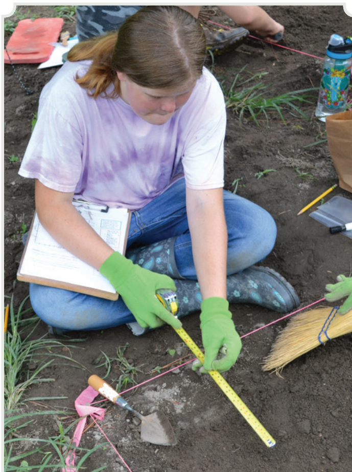
The Dig History Archaeology Camp always results in fascinating finds and muddy campers!

So, as we slog through the 765th day of this interminable year, I have been reminded by our ever-helpful educator that the film "Mad Max" was set in the year 2021. Stay safe, and may 2020 prove to be a cosmic fluke!