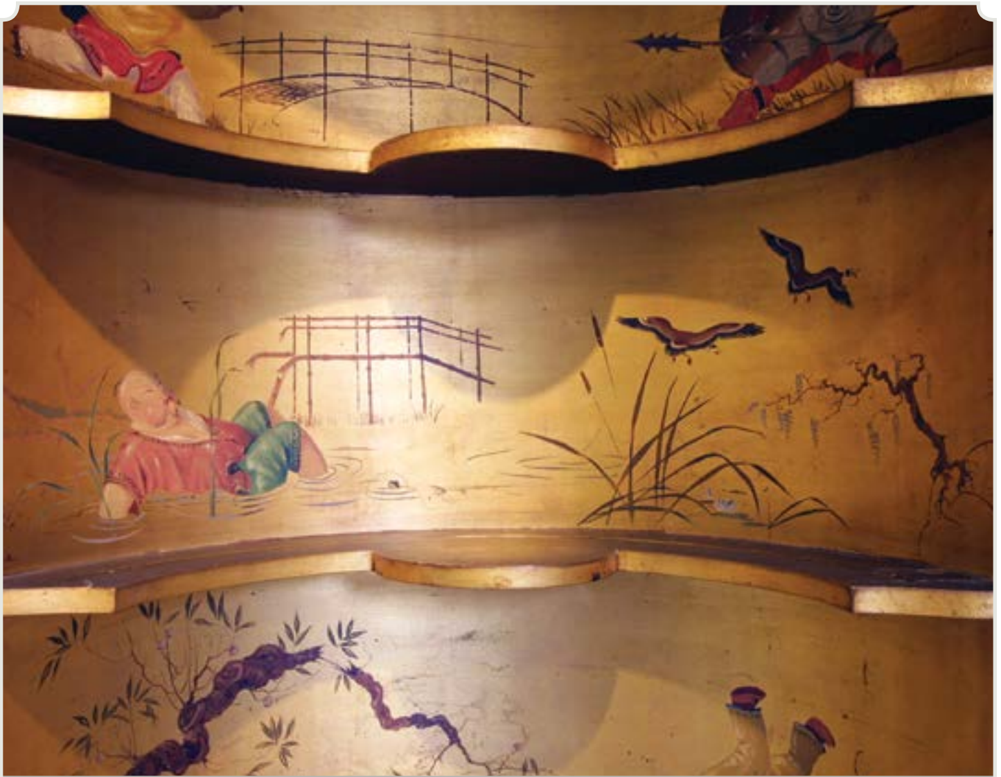
Close-up of May's breakfast room gilded niche

reveal Athos's depth of talent in beautifully composed and modeled still-lives: a bowl of plums with an unusual pipe, a vase of delicate cherry blossoms arranged with an eye for Asian aesthetics, a box wrapped in impressively convincing drapery. May's breakfast room enticed the visitor to spend time looking closely at their environment.