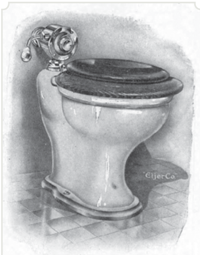
The Eljer Flushing Valve and Closet