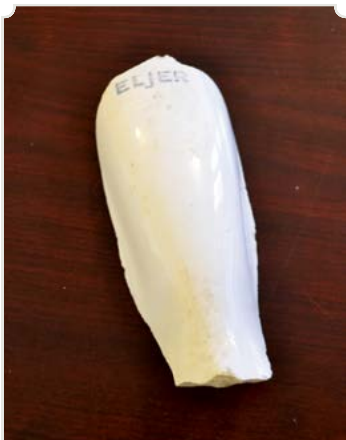
A large whiteware sherd bearing the maker's mark "ELJER"