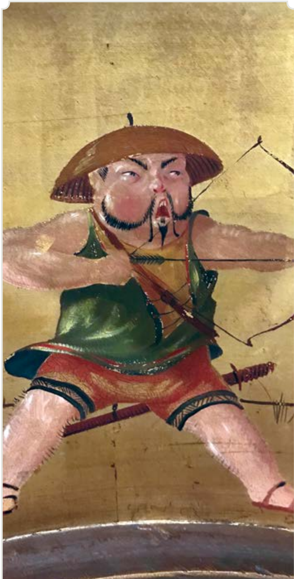
Archer cleaned, but prior to inpainting

Questions still remain—the space is small and doesn't lend itself easily to tours. What do we do about the original arrangement of furniture? Maybe a chest and mirror against the south wall and forgo the drop leaf table? The carpentry of the walnut floor is exquisite, but May had a needlepoint carpet to compliment the apricot taffeta curtains. And speaking of those apricot silk taffeta curtains, would she lean toward a pinkish-orange-toned apricot? Or an orange-yellowish tone? A plain lustrous taffeta? Or one with a delicious water silk pattern woven throughout? The endless questions continue as Menaboni's birds burst into song once again.