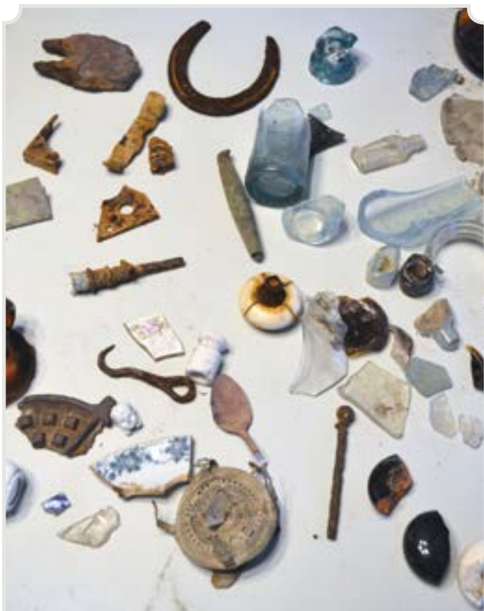
Bits and bobs of Hickory Hill's intriguing past