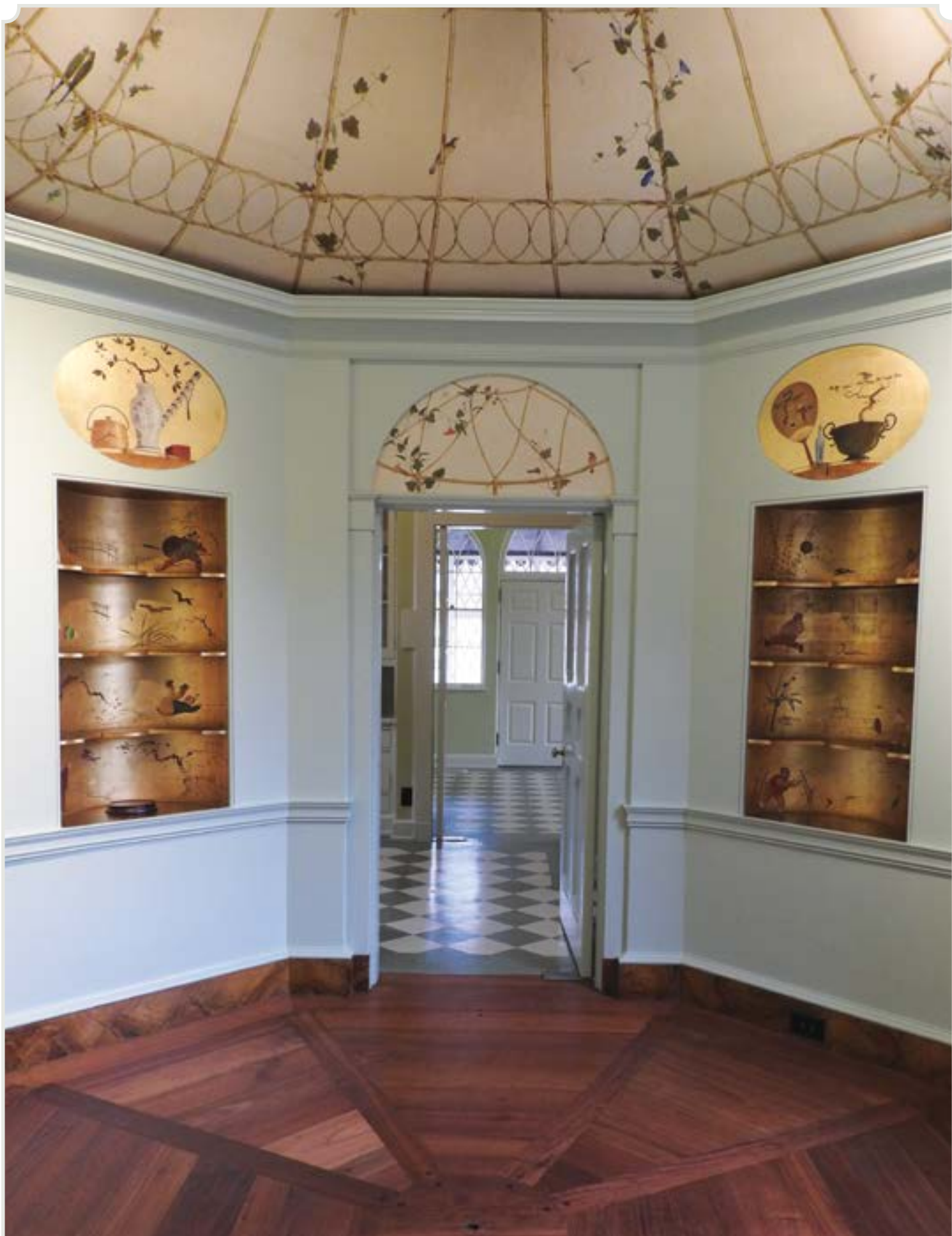
West wall of Goodrum's Menaboni breakfast room