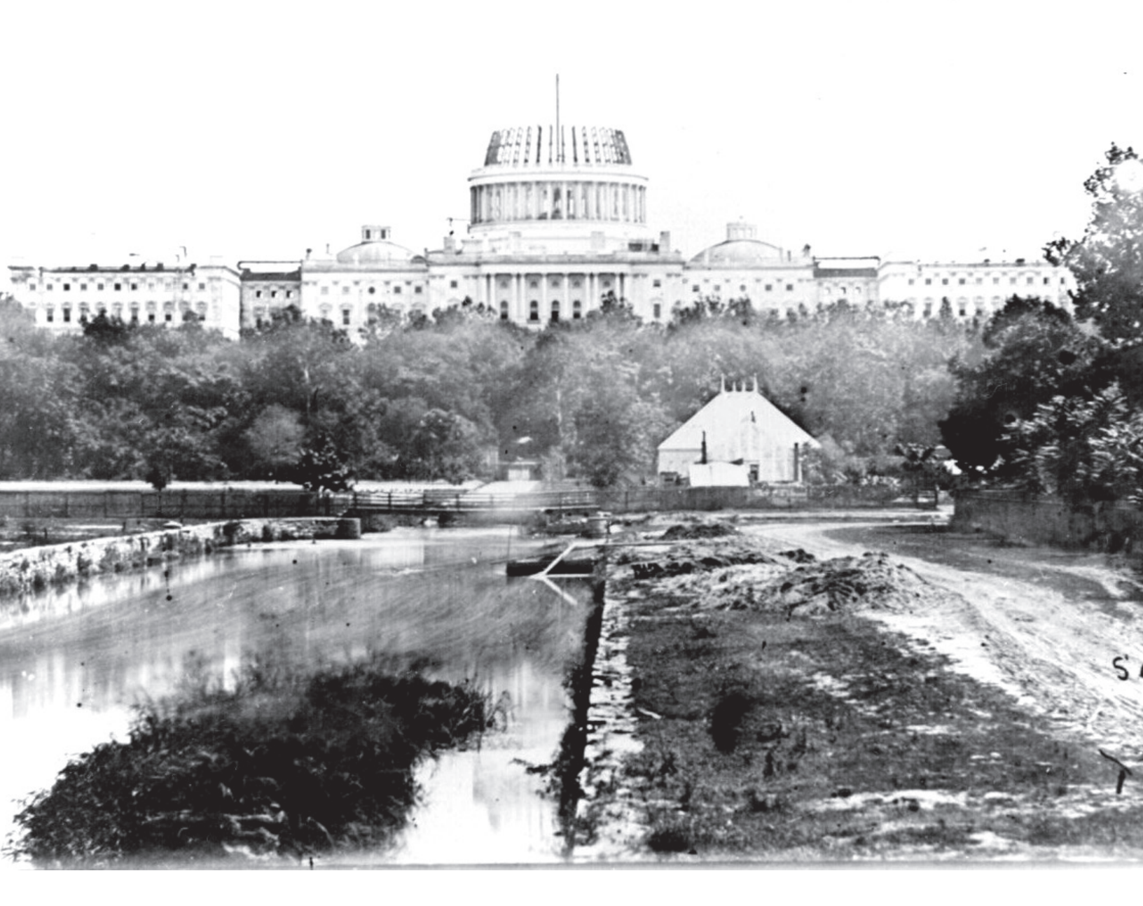
"The South gained Washington city, and what the national capital has ever been worth to us it would be hard to say."